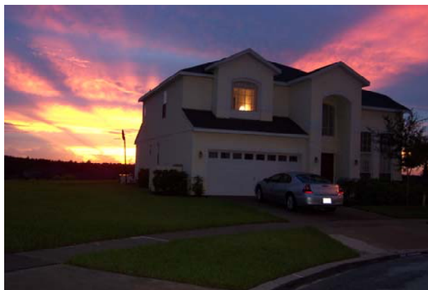
Stunning sunset over Troon Circle.